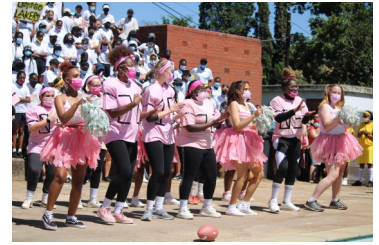
Gerbera Pink Panther Football Team