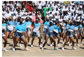
Protea Harley Quinn