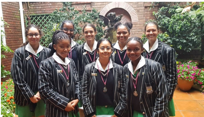
U19 Volleyball team with their silver medals

The u19 team made it through to the semi-finals as well. After a stellar performance against Pretoria High School for Girls, our first team won 25-14, 25-20. They came up against Fourways High School in the final. They played well but narrowly lost 21-25 in both sets. This is the best u19 result we have received in this league and the first team is to be congratulated on their excellent teamwork and dedication to this sport.