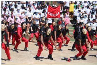
Crassula The Heist