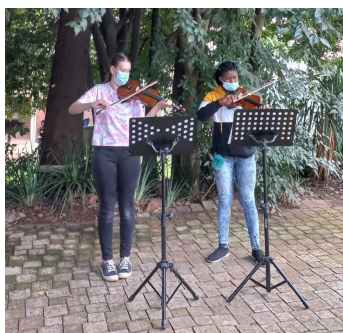
Violins, violins and more violins

Our orchestra members attended a day-camp at school on Saturday, 15 March from 8h00 – 14h00. Sectional rehearsals took place in the PAC, classrooms and even under the trees. The time was very valuable for practicing new pieces together.