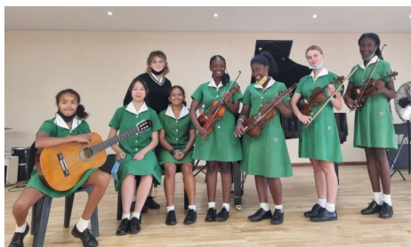
Grade 10 Music students