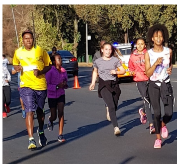
Runners on Roberts Avenue